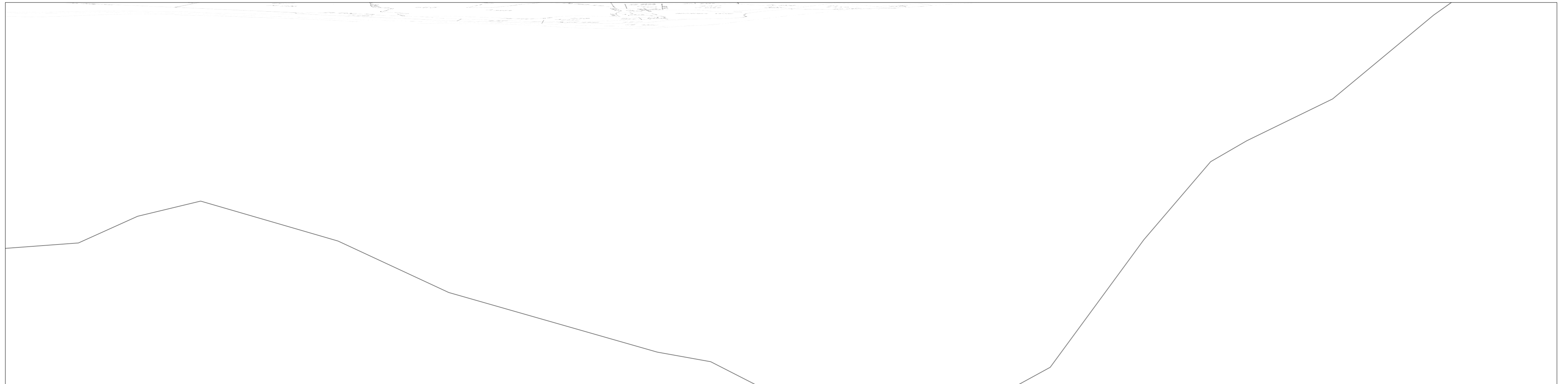
SCHITA GENERALA A LIMITEI INTRAVILANULUI SATULUI BODROGUL-VECHI scara 1:5000